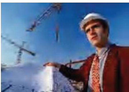
Figure 3: A JPEG 2000 compressed picture.

The advantage of JPEG 2000 is that the blockiness of JPEG is removed, but replaced with a more overall fuzzy picture, as can be seen in Figure 3