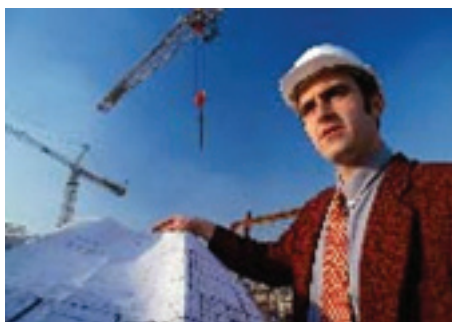
Figure 1: The original picture.