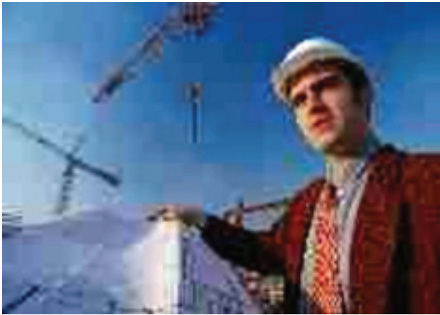
Figure 2: A JPEG compressed picture.